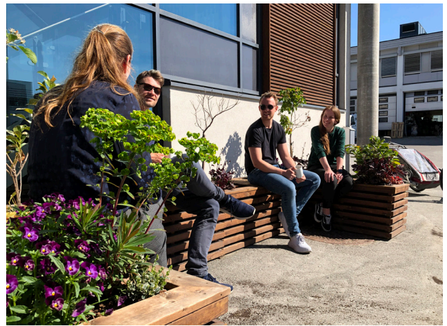
(Photo: Entrance of our headquarters in Molde, Norway, featuring a part of the Axess Urban Garden)

To raise awareness and increase engagement regarding sustainable ecosystems, biodiversity, food recycling and production, we have established an Axess Urban Garden at our headquarters, where we turn food waste into fertile soil and grow decorative and edible plants. Such urban gardens also enhance employee well-being. We hope to inspire and motivate our employees to engage in sustainability and circular economy, and develop new and innovative products, services, and solutions for our clients. Our hope is also for our employees to adopt this mindset in their daily lives, and inspire and motivate their families and friends to make a difference.